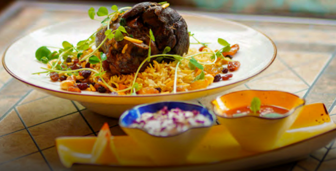
Yemeni Lamb Mandi.

All kebabs are served with rice & salad.