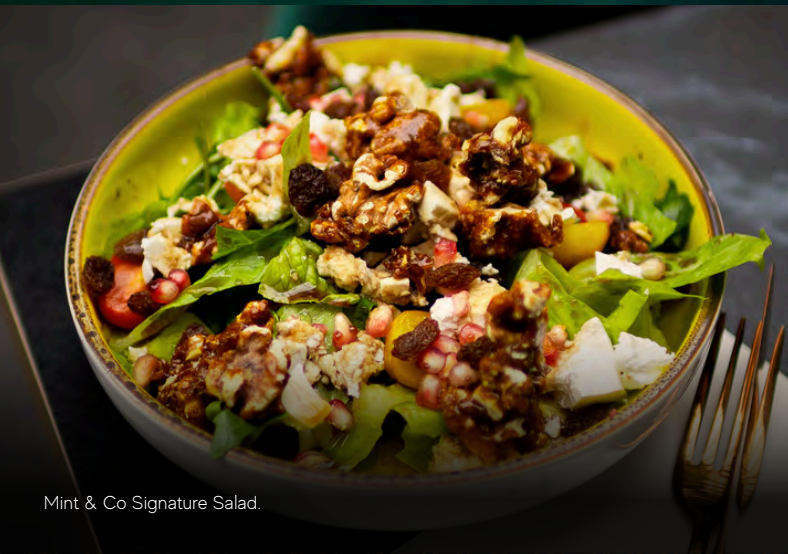
Mint & Co Signature Salad.