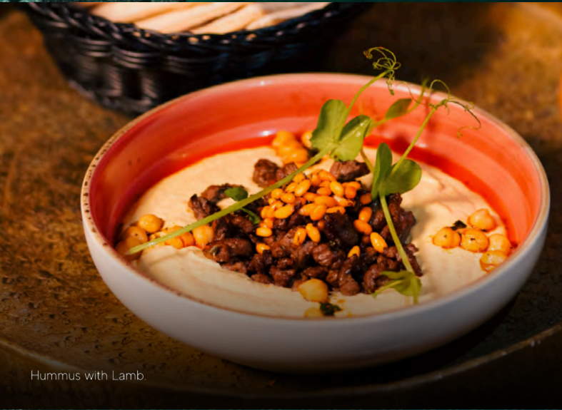
Hummus with Lamb