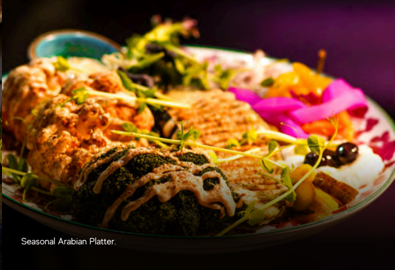
Seasonal Arabian Platter.