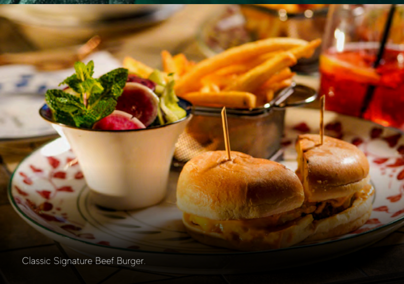
Classic Signature Beef Burger.