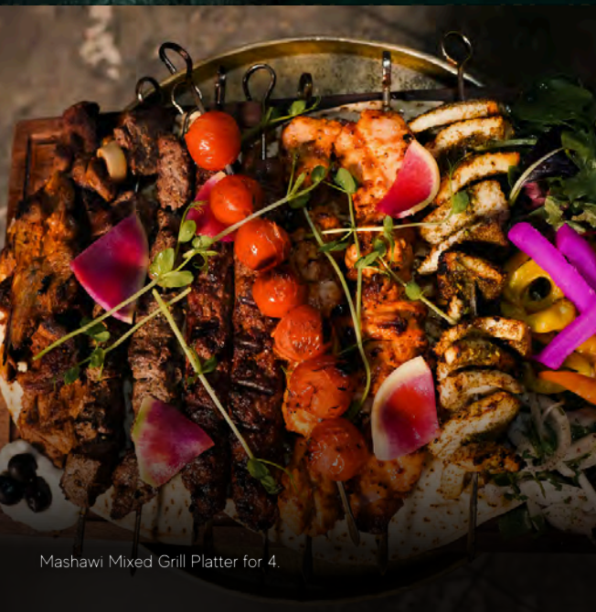
Mashawi Mixed Grill Platter for 4.