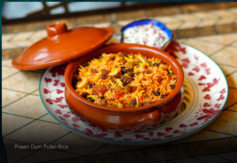
Prawn Dum Pulao Rice.